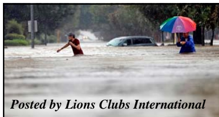
Posted by Lions Clubs International